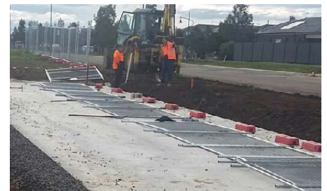
Additional protection works over a section of a pipeline near a proposed development.

Planners and developers play a key role in identifying and locating pipelines early in the planning process to ensure that developers and contractors are aware of the associated requirements, risks and issues around pipeline protection and safety.