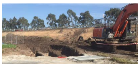
Excavation works to expose a section of a pipeline (top). Preparation works ahead of recoating of a pipeline (centre). Back filling of a section of a pipeline after protection works have been completed (bottom).