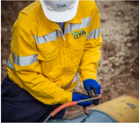
Maintenance and inspection activities on a section of a pipeline.

Pipelines are an important part of Viva Energy's energy supply chain in Victoria. The primary purpose of these pipelines is to transport gas, crude oil or fuel safely, reliably and efficiently. Viva Energy operates and maintains a number of high pressure licensed pipelines in Victoria. These pipelines transport either crude oil or refined petroleum products like diesel, LPG, petrol, or aviation fuels. Viva Energy supplies around half of Victoria's liquid fuel requirements.