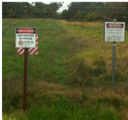
Pipeline easement marked by warning signs.

In order for Viva Energy to fulfil its Pipeline License requirements and/or undertake maintenance works, access is required to its pipelines on a regular or ad hoc basis.