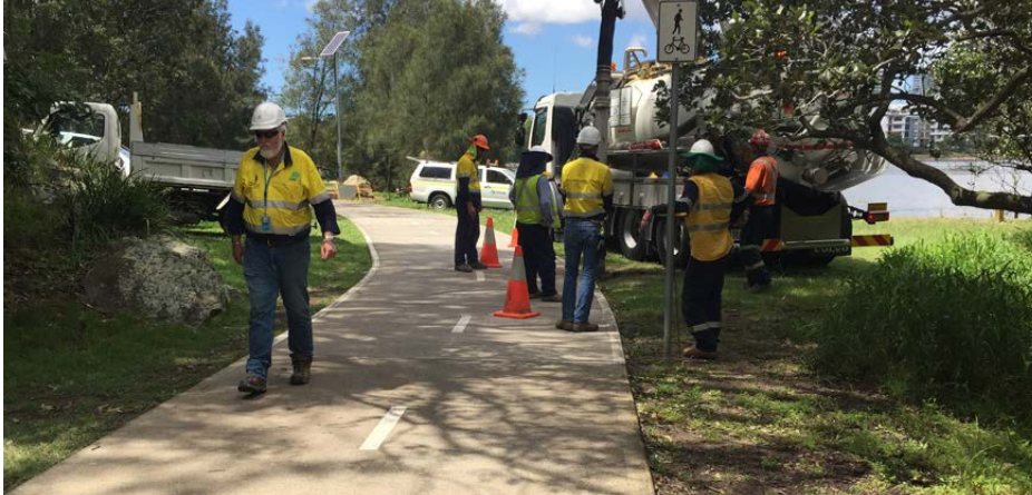
Marking the ground with temporary paint

During this activity, representatives from asset owners attend the site. It should also be noted that we may be required to mark the ground with temporary paint to assist in identifying the assets.