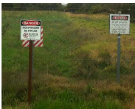
Pipeline easement in rural land.

There are many parties involved when maintenance is required to be performed on a pipeline; including land owners, regulatory authorities, local councils, other underground asset and pipeline owners and the community.