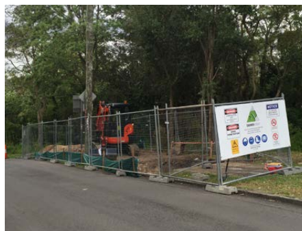
Pipeline maintenance works along an easement

There are various constraints that are applied to pipeline corridors and easements to ensure access to a pipeline is maintained. For example, buildings are prevented, vegetation and addition of fill is restricted, power and telegraph poles, fencing and agricultural activities are controlled.