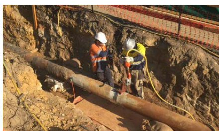
Typical work zones during pipeline maintenance works