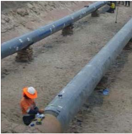
Large scale works may be required as part of additional protection works on pipelines that require substantial forward planning.