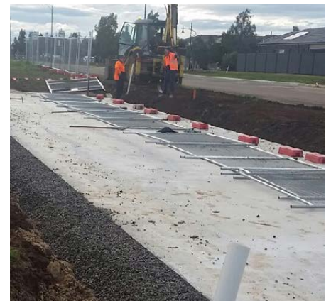
Additional protection works over a section of a pipeline near a proposed development.

Planners and developers play a key role in identifying and locating pipelines early in the planning process to ensure that developers and contractors are aware of the associated requirements, risks and issues around pipeline protection and safety.