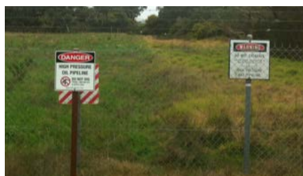
Pipeline easement in rural land

In order for Viva Energy to fulfil its regulatory requirements and/or undertake maintenance works, access is required to its pipelines on a regular or ad hoc basis.