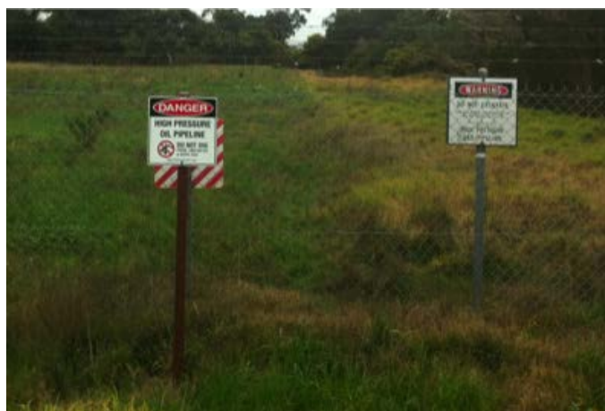
Pipeline easement marked by warning signs.

Pipeline warning signs are strategically placed along the pipeline route within the vicinity of the pipeline to warn the community that there are pipelines in the area. They do not give the exact location of the pipeline.