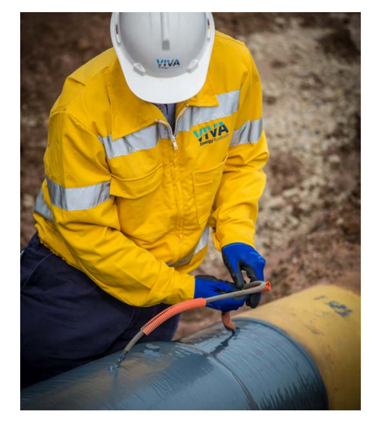
Maintenance works being carried out on a pipeline.