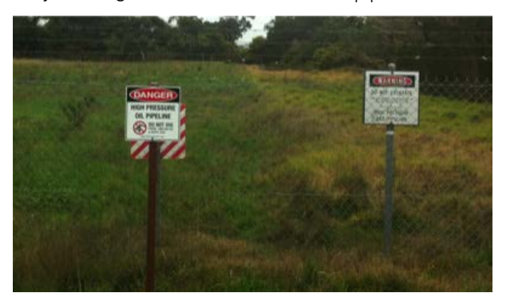
Pipeline easement marked by warning signs.

Pipeline warning signs are strategically placed along the pipeline route within the vicinity of the pipeline to warn the community that there are pipelines in the area. They do not give the exact location of the pipeline.