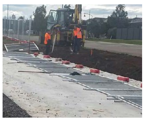
Pipeline easement marked by warning signs.

Planners and developers play a key role in identifying and locating pipelines early in the planning process to ensure that developers and contractors are aware of the associated requirements, risks and issues around pipeline protection and safety.