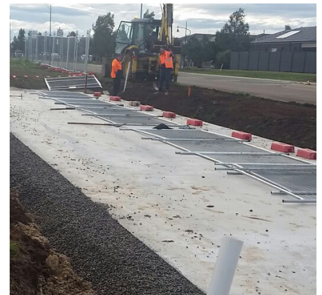
Additional protection works being carried out over a section of a pipeline near a proposed development.

Planners and developers play a key role in identifying and locating pipelines early in the planning process to ensure that developers and contractors are aware of the associated requirements, risks and issues around pipeline protection and safety.