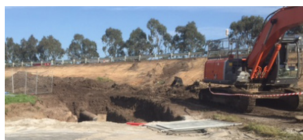
Excavation works to expose a section of a pipeline (top). Preparation works ahead of recoating of a pipeline (centre). Back filling of a section of a pipeline after protection works have been completed (bottom).