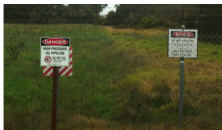
Pipeline easement in rural land

In order for Viva Energy to fulfil its regulatory requirements and/or undertake maintenance works, access is required to its pipelines on a regular or ad hoc basis.