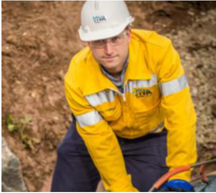
Maintenance and inspection activities being carried out on a section of a pipeline.

Pipelines are an important part of Viva Energy's energy supply chain in NSW. The primary purpose of these pipelines is to transport fuel safely, reliably and efficiently.