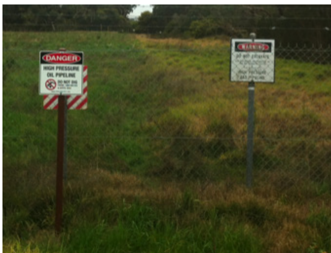
Pipeline easement marked by warning signs.

Pipeline warning signs are strategically placed along the pipeline route within the vicinity of the pipeline to warn the community that there are pipelines in the area. They do not give the exact location of the pipeline.