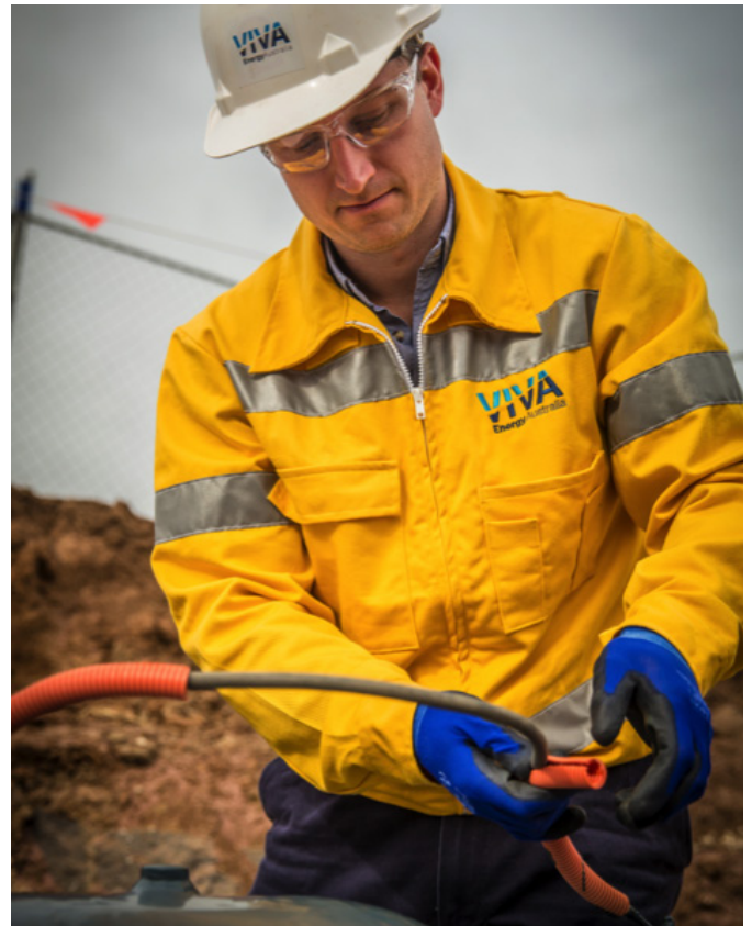
Maintenance works being carried out on a pipeline.