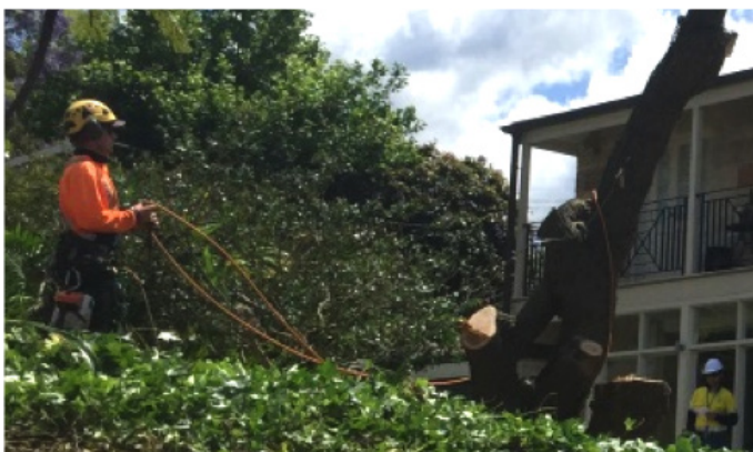
Tree removal works in progress ahead of pipeline maintenance works.

If you plan on undertaking any of these activities, please contact "Dial Before You Dig" immediately. If you have any questions, please contact Viva Energy.