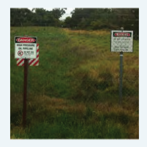
Pipeline easement marked by danger signs

Pipeline warning signs are strategically placed along the pipeline route within the vicinity of the pipeline to warn the community that there are pipelines in the area. They do not give the exact location of the pipeline.