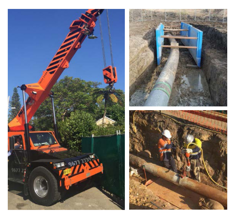
Typical work zones during pipeline maintenance works