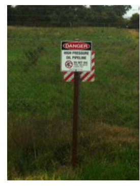
Pipeline easement in rural land.

There are various constraints that are applied to pipeline corridors and easements to ensure access to a pipeline is maintained. For example, buildings are prevented, vegetation and addition of fill is restricted, power and telegraph poles, fencing and agricultural activities are controlled.