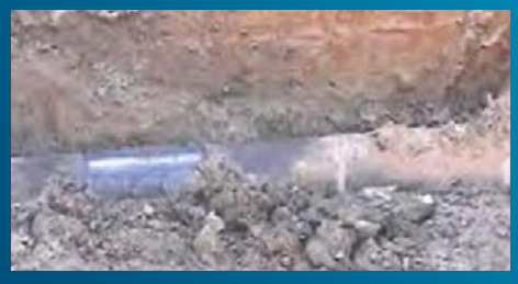
The full condition of the pipeline is verified once it is excavated

• Some works may require a shutdown of the pipeline to ensure supply to fuel terminals is maintained which requires careful and detailed planning.