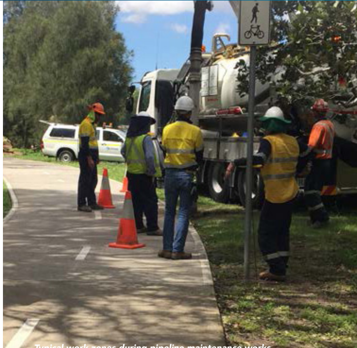
Typical work zones during pipeline maintenance works