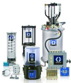
Automatic Lubrication Systems

From the smallest application to the largest we have grease equipment that will help you and your equipment get the right amount of protection at the correct intervals.