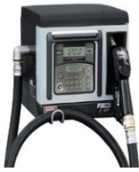
Fuel Dispensing Packages