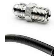
Fittings and Hoses