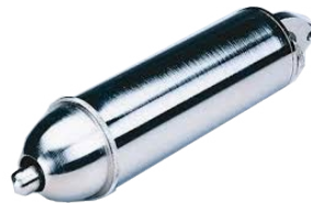
Fuel Sampling Bacon Bombs