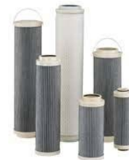
Replacement Filter Elements for Fuels and Lubes