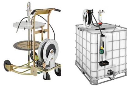
Pump Dispense Kits