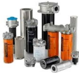
Replacement Spin On Filters and Housings for Fuels and Lubes