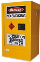
Dangerous Goods Containers

Our technicians are able to advise about the storage and tank equipment that best suits your needs that also protects your fuel, oil and grease products, and reduces the risk to you, your equipment and the environment.