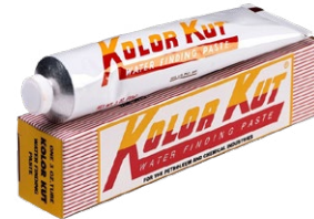
Water Finding Paste