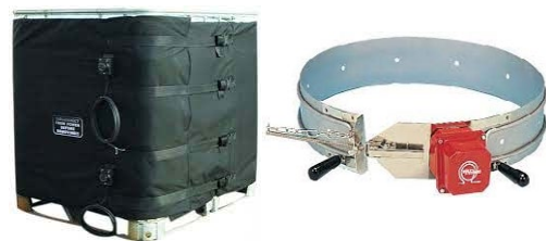
Drum, IBC and Hopper Heaters