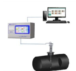
Automatic Tank Gauging