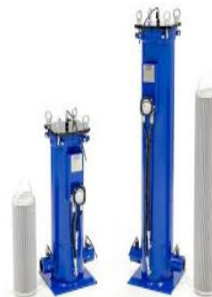
Inline Filter Housing and Manifolds