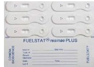
Fuel Test Kits