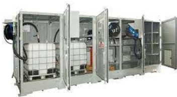
Containerized Lube Storage