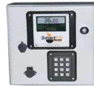
Fluid Management Systems