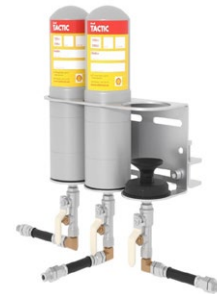
Single Point Lubricators