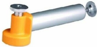
Oil Sample Pumps

Being a vital tool in understanding the health of your hydrocarbons and equipment, we can provide test kits, analysis, and the equipment required for you to monitor the condition of your equipment.